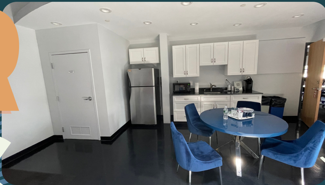
Infinity Room Kitchen

Throughout all of our spaces, we welcome your signage, displays, and other swag to accentuate and elevate visibility for your products. Let's get creative!